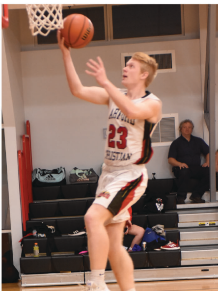
New soccer goals

It is more important than ever for HCS to use the best available equipment to enhance our athletic programs. Below are just some of the investments we have made from the funds raised through this annual event.